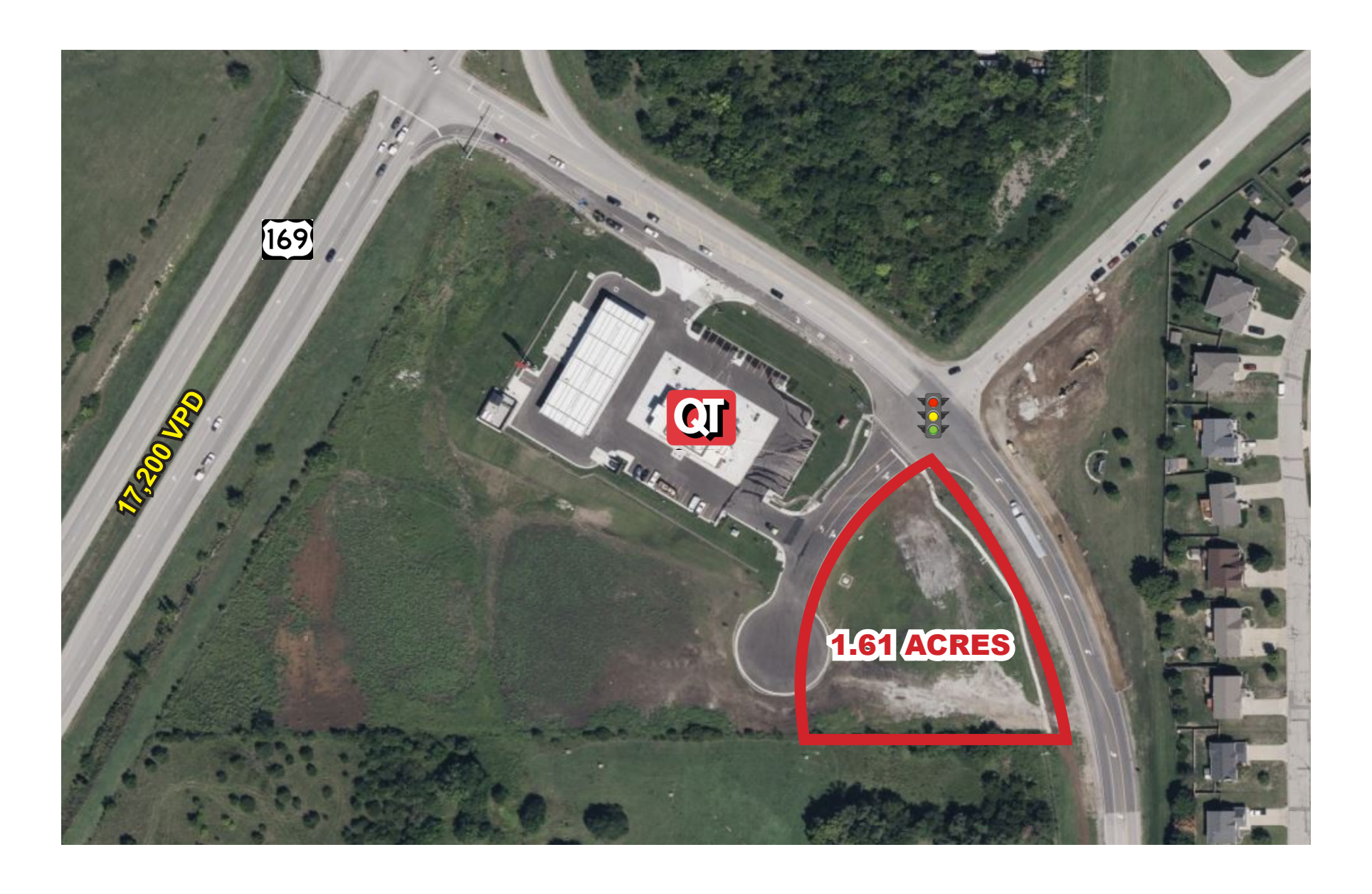
Traffic Count